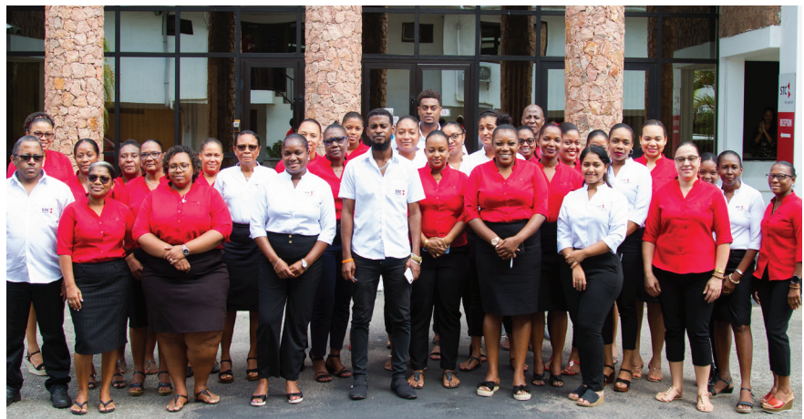
A group of our personnel at STC Headquarters