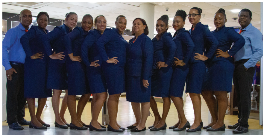
Our Duty-Free Airport team

Priding ourselves in offering an exceptional service to all our customers!