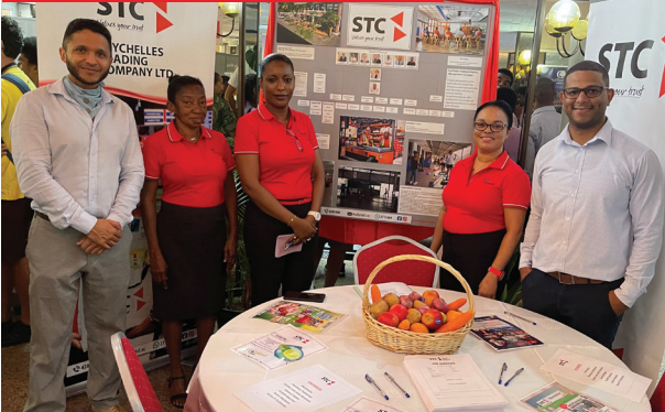
Productivity Exhibition, a one of a kind event tailored for working companies to heighten efficiency in the workplace. Held at ICCS on Friday 28 th July 2023.