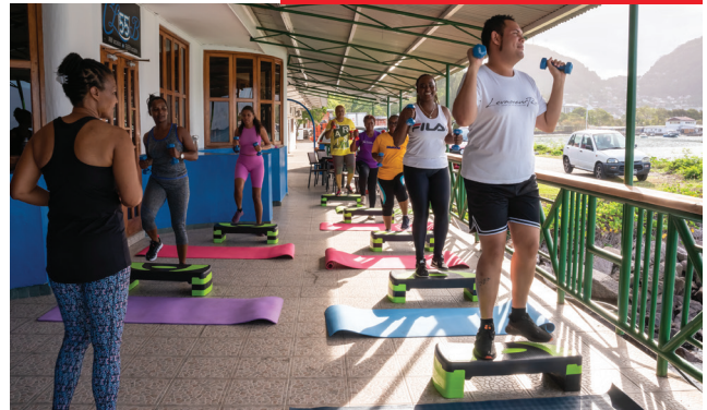
Weight warriors in action with new stock of equipment received for the program with the ultimate objective of pursuing a healthy lifestyle.

Unlocking the secrets to Healthy living!