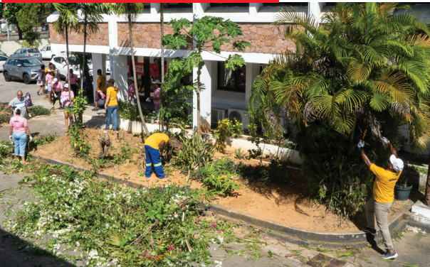
Clean-up Day held at all our business operations on Mahe Praslin and La Digue on Saturday 15 th July 2023.

Unlocking the secrets to Healthy living!