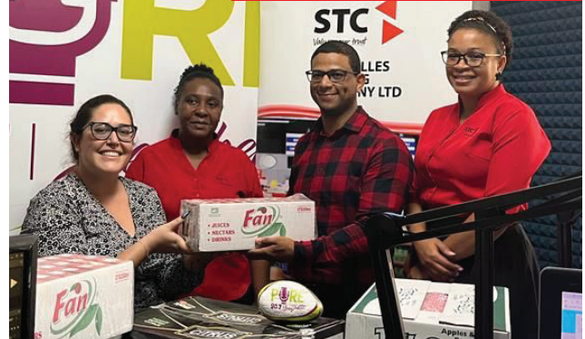
Honoring and appreciating selfless contributions of real-life heroes giving the gift of life through World Blood Donation Drive event organized by Ministry of Health and Pure 907 Radio .