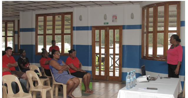
Our commitment to promoting health and wellbeing in the work place - HASO (The HIV and Aids Support Organization ) sensitization session at STC