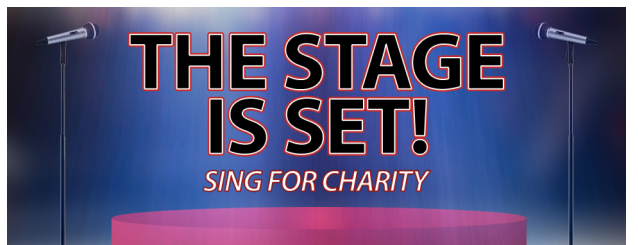
STC OFFICE CHOIR - ONE, TWO, THREE, LET'S ROLL!