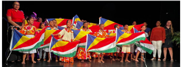
Sharing joy and promoting the importance of unity and cultural exchange – Mont Fleuri School heading off to Mauritius during the August holiday.