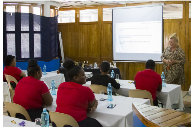
Keeping up abreast with the travel retail world – Heinemann representative providing training in perfumes brands