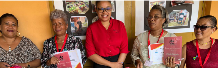
STC community spirit shines through- 30 years celebration of School for the Exceptional Child!