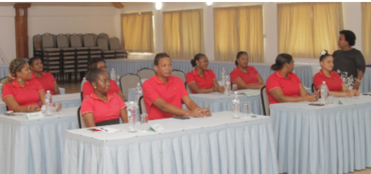
Being customer centric and enhancing service delivery – Training programs for our professionals