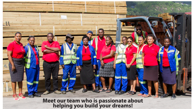
Meet our team who is passionate about helping you build your dreams!

STC looks forward to serve you for many years to come!